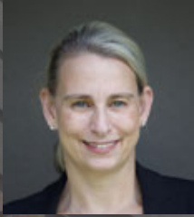
Sen. Kate Lieber Senate District 14