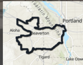
Washington County (Portion)