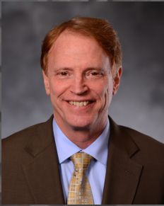
Sen. Tim Knopp Senate District 27