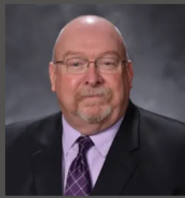
Sen. Lynn Findley Senate District 30