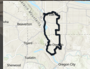
Multnomah County (Portion)