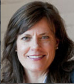
Sen. Kathleen Taylor Senate District 21