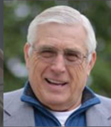
Rep. Boomer Wright House District 9