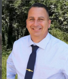
Rep. Dwayne Yunker House District 3