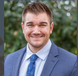
Rep. Alek Skarlatos House District 4