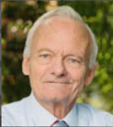
Sen. Art Robinson Senate District 2