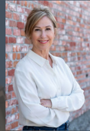
Rep. Christine Goodwin House District 4