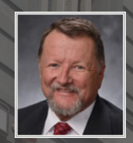
Sen. Fred Girod Senate District 9