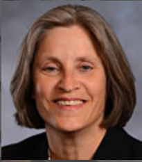
Sen. Lisa Reynolds Senate District 17