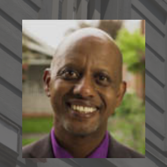
Sen. Kayse Jama Senate District 24