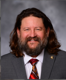
Sen. Cedric Hayden Senate District 6