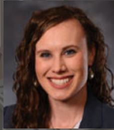
Rep. Jami Cate House District 11