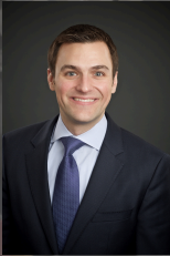
Sen. Dan Rayfield Senate District 16