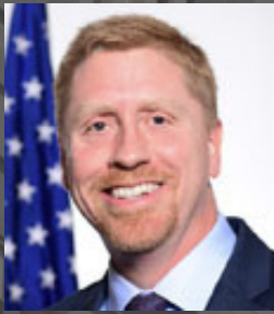
Sen. Daniel Bonham Senate District 26