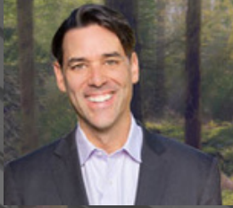
Sen. Rob Wagner Senate District 19