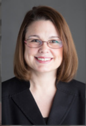
Sen. Sara Gelser Blouin Senate District 8