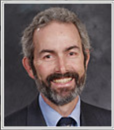
Sen. Floyd Prozanski Senate District 4