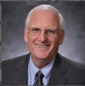
Sen. Bill Hansell Senate District 29