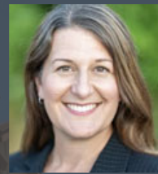
Rep. Courtney Neron House District 26