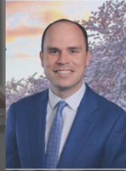
Rep. Ben Bowman House District 25