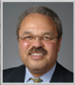
Sen. Lew Frederick Senate District 22