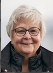
Sen. Suzanne Weber Senate District 16