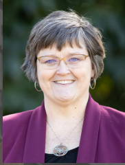
Sen. Janeen Sollman Senate District 15