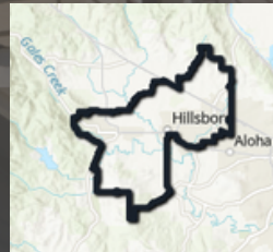
Washington County (Portion)