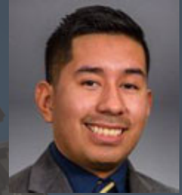
Rep. Ricki Ruiz House District 50