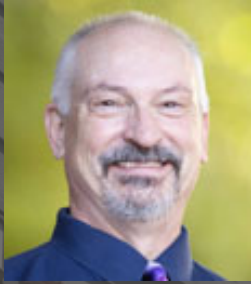
Sen. Chris Gorsek Senate District 25