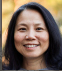
Rep. Thuy Tran House District 45