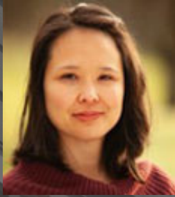
Sen. Khanh Pham Senate District 23