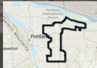
Multnomah County (Portion)