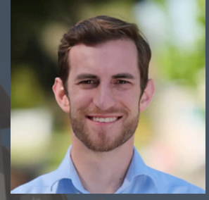
Rep. Willy Chotzen House District 46