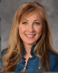
Sen. Kim Thatcher Senate District 11