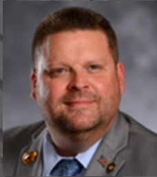
Sen. David Brock Smith Senate District 1