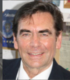
Rep. Court Boice House District 1