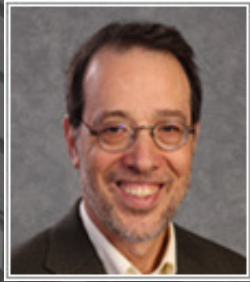
Sen. Michael Dembrow Senate District 23